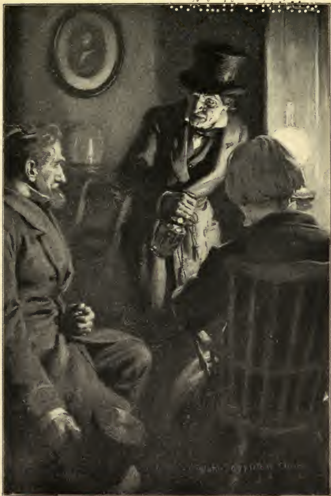
"SAMUEL SLID INTO A CHAIR NEAR THE DOOR"